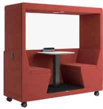
YO-YOPOD® 2-Seater / HALFBACK