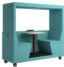
YO-YOPOD® 2-Seater / HALFBACK