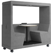
YO-YOPOD® 2-Seater / HALFBACK