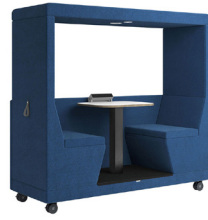
YO-YOPOD® 2-Seater / HALFBACK