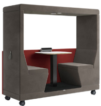
YO-YOPOD® 2-Seater / HALFBACK