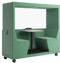
YO-YOPOD® 2-Seater / HALFBACK