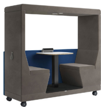
YO-YOPOD® 2-Seater / HALFBACK