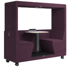
YO-YOPOD® 2-Seater / HALFBACK