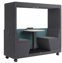
YO-YOPOD® 2-Seater / HALFBACK