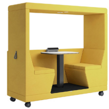
YO-YOPOD® 2-Seater / HALFBACK