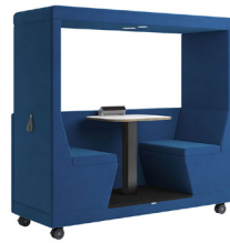
YO-YOPOD® 2-Seater / HALFBACK