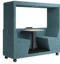
YO-YOPOD® 2-Seater / HALFBACK