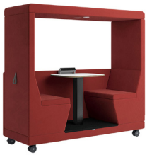
YO-YOPOD® 2-Seater / HALFBACK