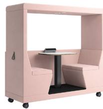
YO-YOPOD® 2-Seater / HALFBACK