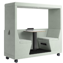
YO-YOPOD® 2-Seater / HALFBACK