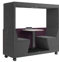
YO-YOPOD® 2-Seater / HALFBACK