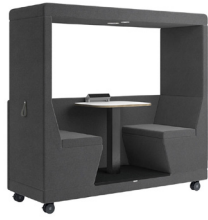
YO-YOPOD® 2-Seater / HALFBACK