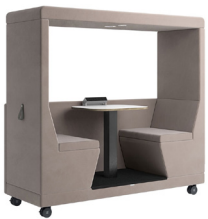
YO-YOPOD® 2-Seater / HALFBACK