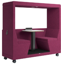
YO-YOPOD® 2-Seater / HALFBACK