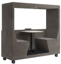
YO-YOPOD® 2-Seater / HALFBACK